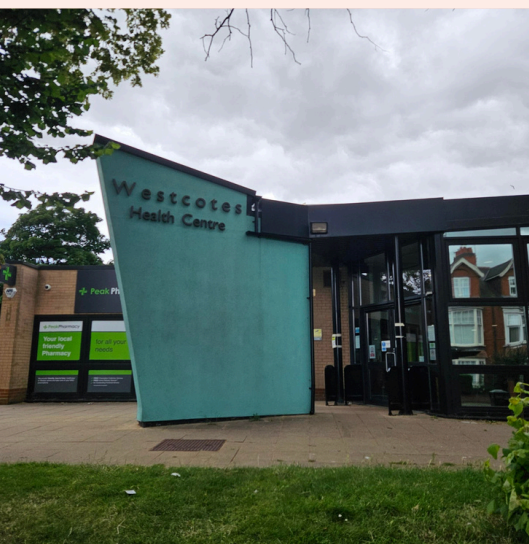
Westcotes Health Centre - Main entrance