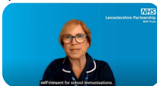
Our Clinical Lead explains self-consent tiny.cc/selfconsent

You can also let us know if you do not want the young person to be vaccinated.